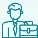
Wealthy Global Citizens

Wealthy Global Citizens, Wealthy Pensioners, Work-from-Thailand Professionals, and Highly Skilled Professionals. Spouses and dependants of LTR visa holders will also qualify for the same visas.